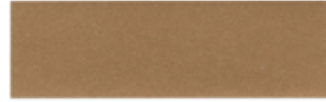
CLASSIC COPPER ★