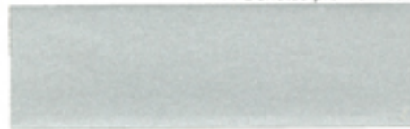
SILVER METALLIC ★