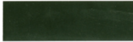
EXTRA DARK BRONZE